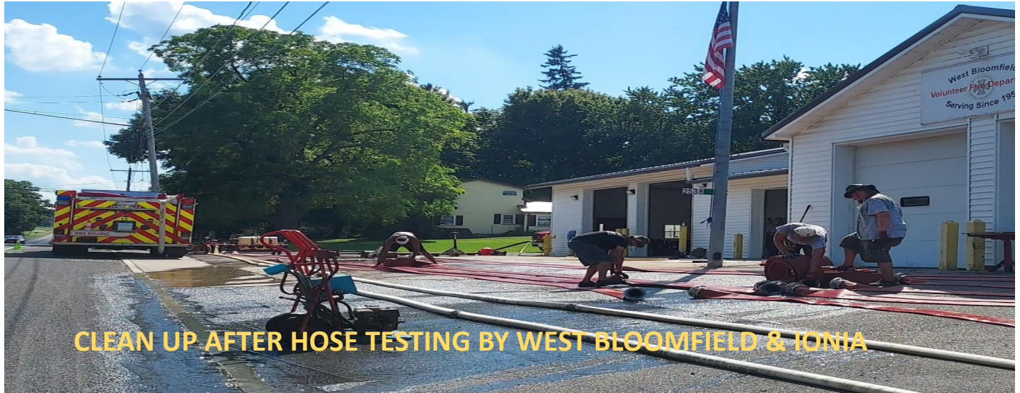
CLEAN UP AFTER HOSE TESTING BY WEST BLOOMFIELD & IONIA

The leaves are turning, the chill is in the air, and it is time for everyone to make sure their chimneys are cleaned before you start that fall wood stove or fireplace fire to get rid of the early morning chill. This is also a good time to check and make sure smoke detectors and CO detectors are in working order and have fresh batteries if they are replaceable. Make sure you have an escape plan in case of emergencies and, most importantly, designate a meet-up place outside where all family members know to meet. It should be away from any danger and a place where arriving firefighters can check to make sure everyone is out of the building if something does happen. Try to practice escape drills a couple times so everyone is aware of what to do and where to go.